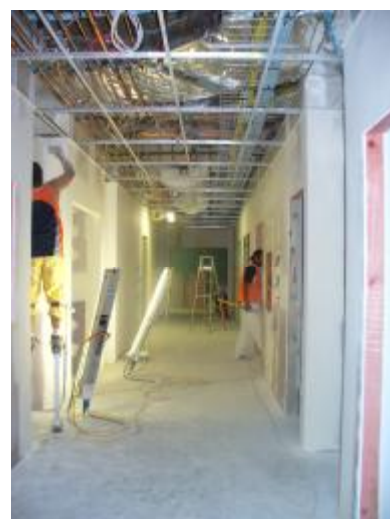
This is the new internal corridor that leads to the general bed spaces.