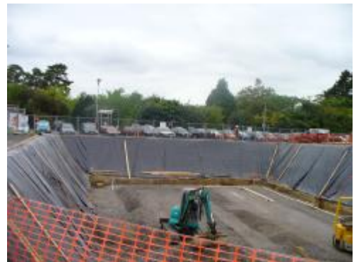
The first half of the L-shaped building has been dug out.

The piece of the old building was placed for remembrance sake.