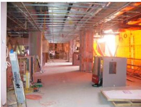
Open plan bed spaces. The low level wall in this photo is one of the nurses write up bays

Thanks to all the staff and public who have tolerated the building work that has, at times been disruptive. Your patience and understanding during the construction of this new Unit is greatly appreciated by all involved with the project.