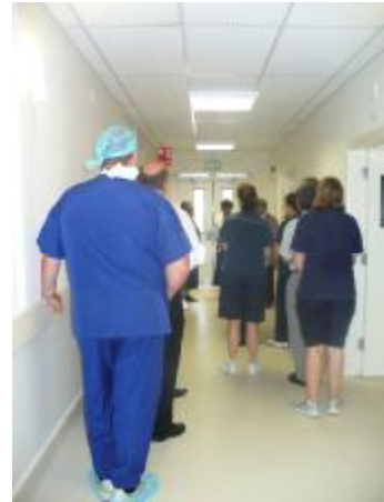
CIU Staff attend the blessing of their new area.

"Staff are also enjoying the windows and doors that open to the outside.