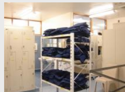
Refurbished change room

Work has now begun on refurbishing the male change rooms.