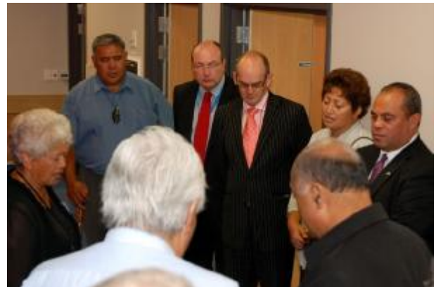
Prayers being offered during the Blessing