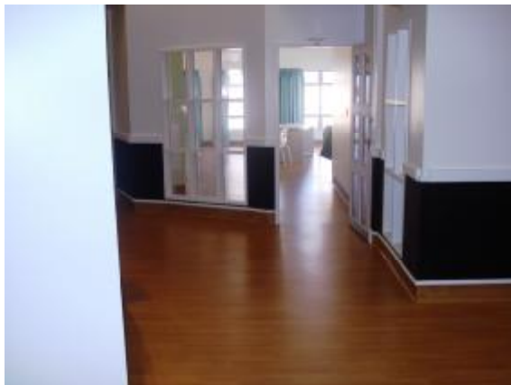
Reception to Dining Room

“There is also a dedicated sensory room which is supported by Te Pou, (the national centre for mental health research, information and workforce development) as part of a national pilot. This space can be used by people to develop techniques that help them to relax and self sooth. Research has also shown that a sensory room can also reduce the incidents of seclusion and restraint.”