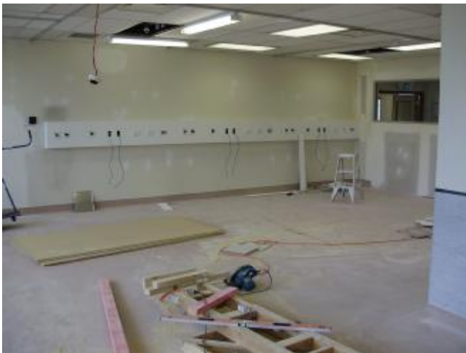
2 ND Stage Area

The new TADU is 3 times the size of the existing DOSA with large open spaces, staff friendly working areas, a separate waiting room, pre-op and recovery area, procedure room and consult/treatment rooms, that can be used as flexi spaces. The 2 nd stage area (pictured below) will have 3 bed spaces and 8-10 chairs.