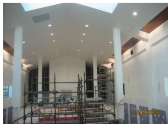
Atrium Extension – construction progressing