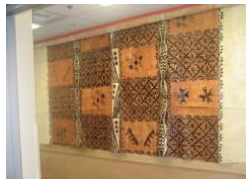
The Tapa cloth takes pride of place by the entrance of the Rito Unit