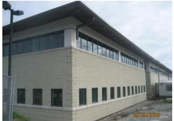
Building A - with the scaffolding recently removed

Once Buildings A and B are occupied work will begin on the refurbishment of a number of the existing clinics on Level 1 of the Manukau SuperClinic, General Medicine, Breast Screening and Hands Therapy.