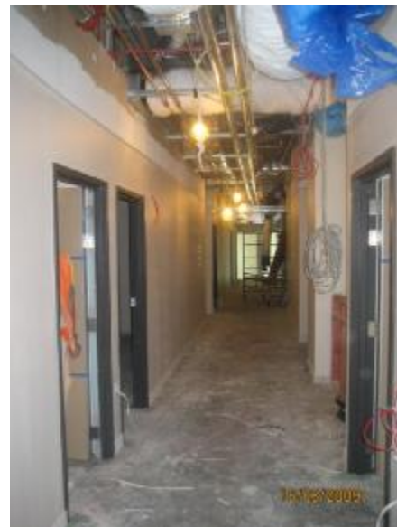
Building A - interior fit out progressing