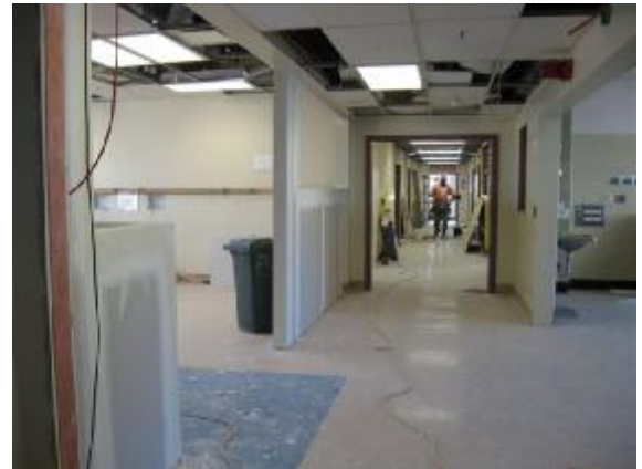
Refurbishment of the old ICU

“It’s a welcome change from our existing department which is cramped and totally inadequate for the increasing number of patients coming through the Unit.