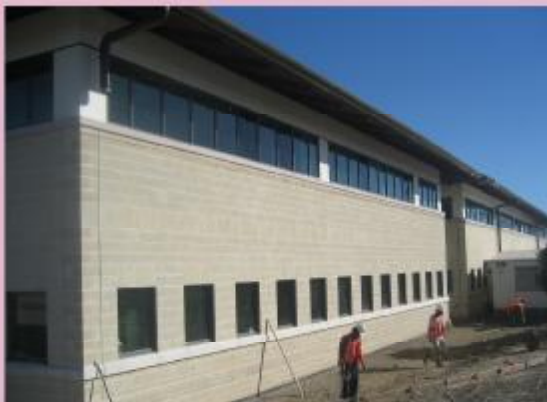
Construction of Buildings A & B

Two new buildings (A and B) are nearing completion at the back of the SuperClinic. These buildings will be joined to the SuperClinic via a new Atrium. In June 2009 Buildings A and B will be occupied by: